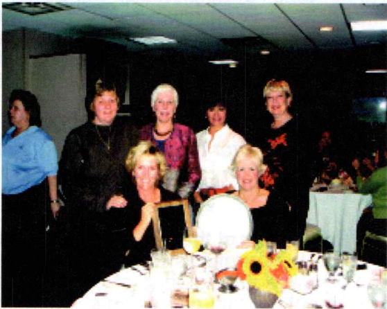
2007 Team Matches Net Winners - Newark Country Club