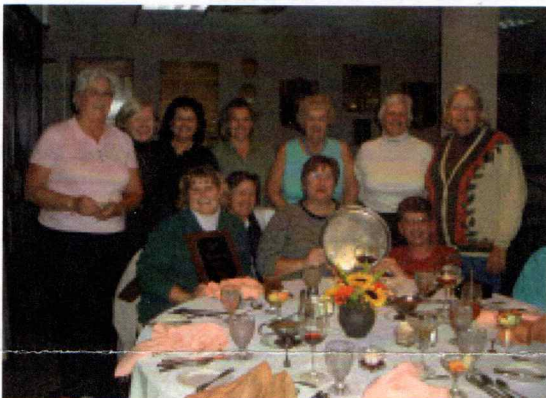
2007 Team Matches Gross Winners - Chesapeake Bay